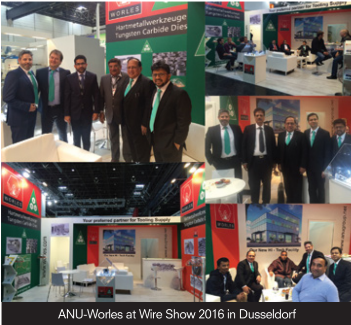
ANU-Worles at Wire Show 2016 in Dusseldorf

Our Joint Venture between India and Spain (ANU-WORLES) makes us attractive for passing customers to stop by. A delight!